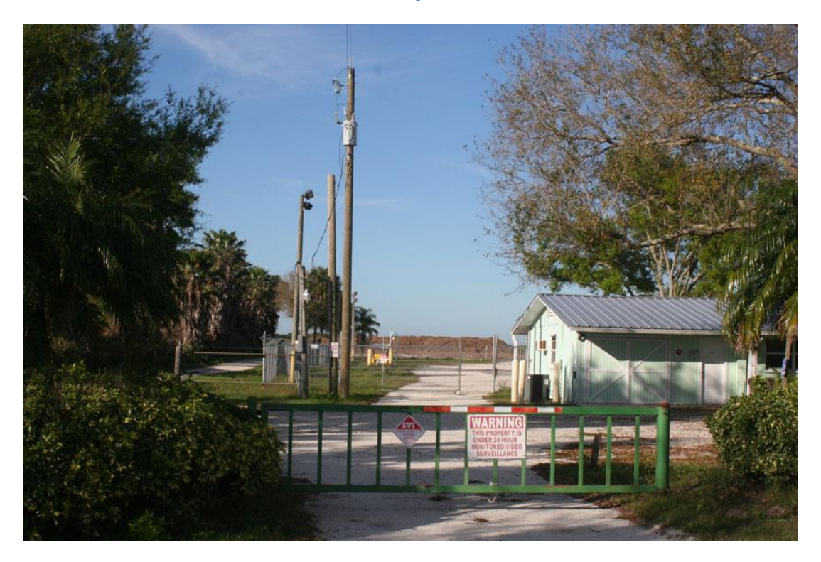
Gate & Divided Driveway