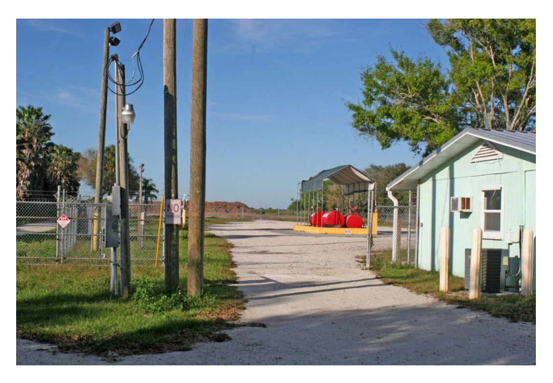
Fuel Station within Secured Yard