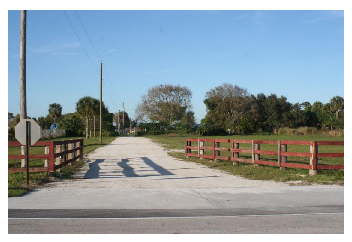
Open Front Yard