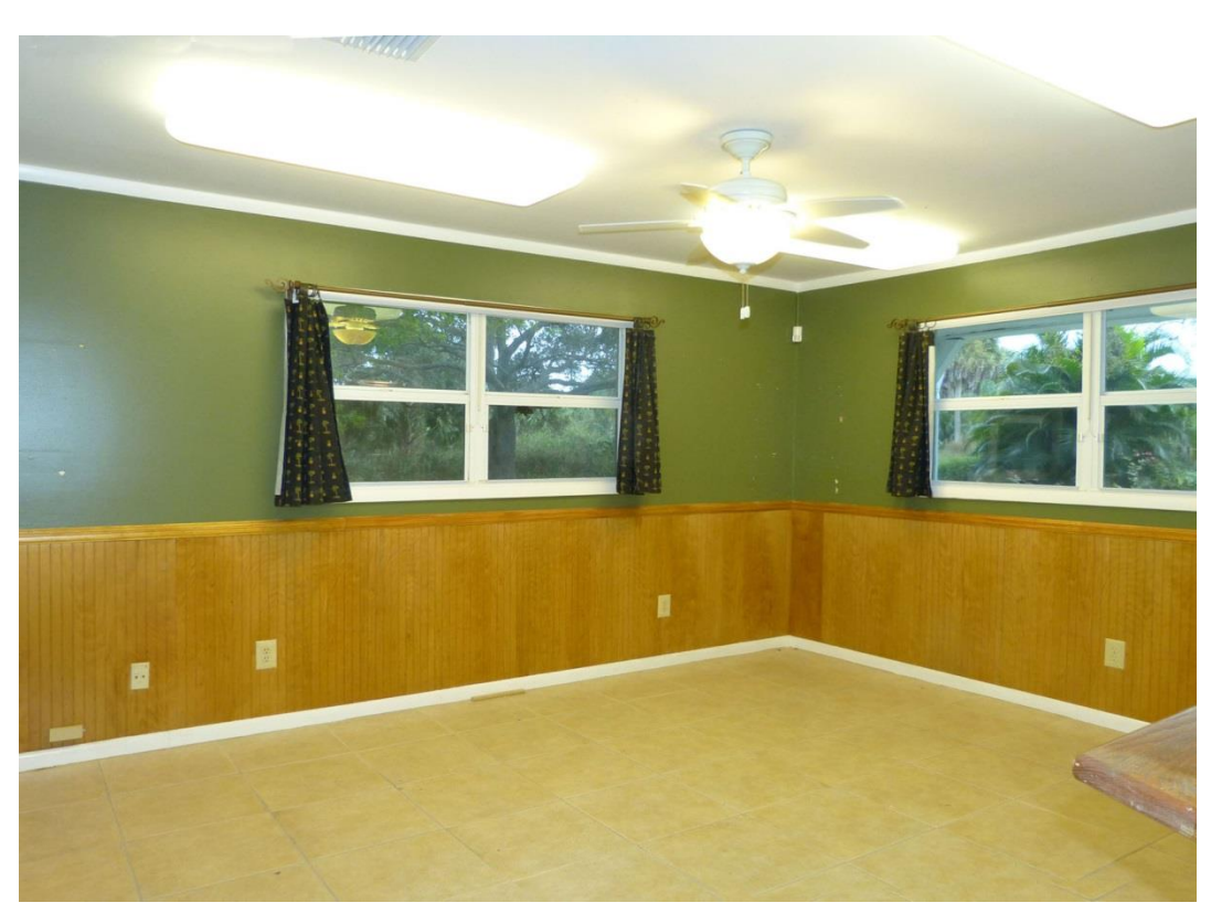
Office Building Kitchen